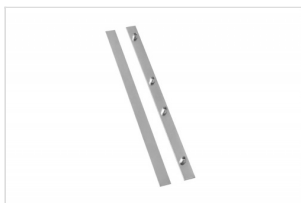
Extension set Eco/Simple