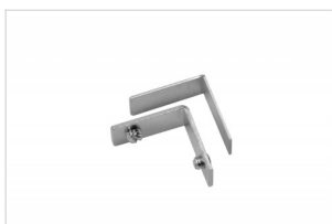
Lockset hanging profile